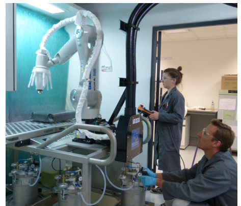
Rescol - paint laboratory using Dürr painting equipment