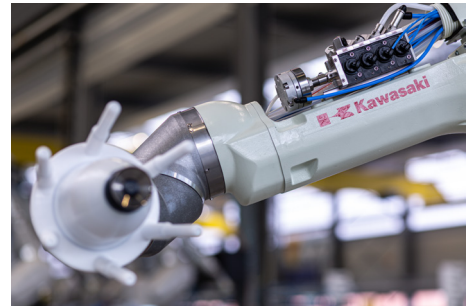
Dürr application equipment on Kawasaki robot